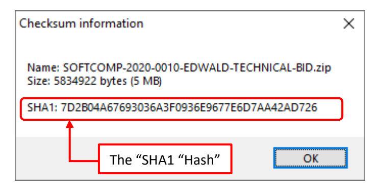
Figure 3 SHA1

Clicking Ctrl-C grabs the contents of this box. You can close the box after copying the contents. (You can paste the contents into a mail message, for instance.)