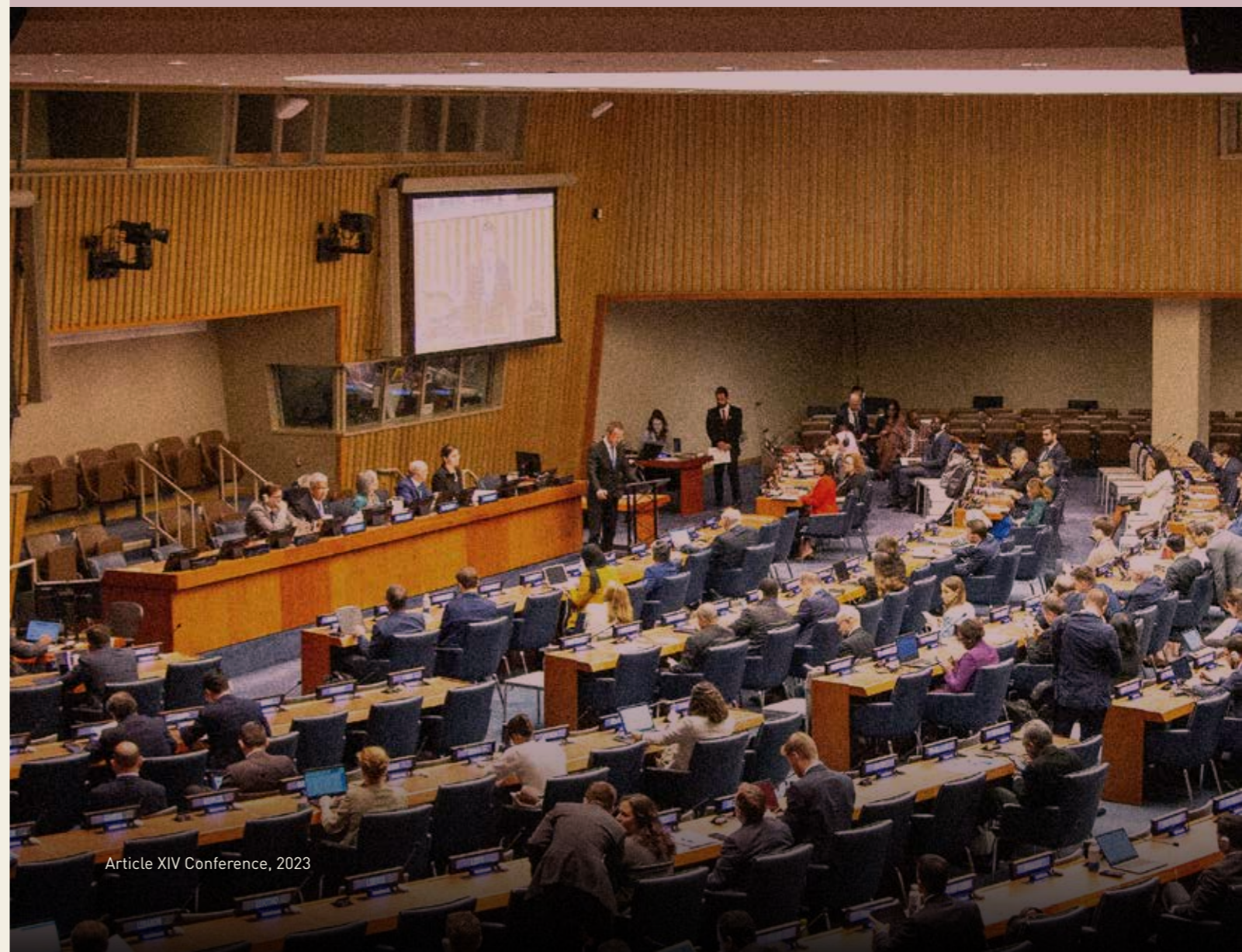
Article XIV Conference, 2023

Additionally, the CTBTO employs nearly 300 multidisciplinary professional and support staff from around 90 Member States. Over the years, staff from the Latin America and Caribbean region have held positions at the Director level, the highest in the career structure of the Organization. This includes representatives from countries such as Brazil, Mexico, and others.