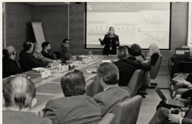
Meeting of GRULAC (Group of Latin America and the Caribbean) Ambassadors with CTBTO, 2024