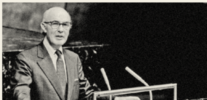
Ambassador Alfonso García Robles, Mexican diplomat and Nobel Peace Prize laureate addressing UN General Assembly, 1974

To ensure the Treaty of Tlatelolco's implementation, the Agency for the Prohibition of Nuclear Weapons in Latin America and the Caribbean (OPANAL) was established in 1969. OPANAL plays a vital role in monitoring compliance and upholding the commitments made by the States Parties.