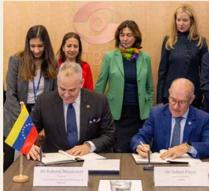
CTBTO and Venezuela representatives at tsunami warning agreement signing ceremony, 2024

Another example is the Argentine submarine ARA San Juan, which disappeared on 15 November 2017 after its last confirmed contact, about 500 kilometres off the coast of San Jorge Gulf. At the request of Argentina, the CTBTO provided data from its IMS. Two hydroacoustic