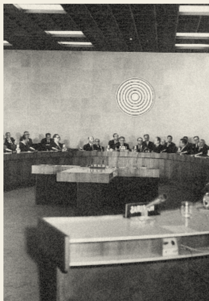
Preliminary Meeting for Constitution of Organization for Prohibition of Nuclear Weapons in Latin America, Mexico, 1969

The CTBTO expanded these efforts in 2005 by forging a similar agreement with the Association of Caribbean States (ACS).