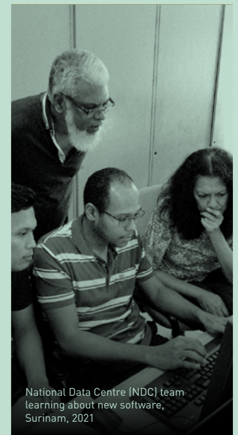
National Data Centre (NDC) team learning about new software, Surinam, 2021

The CTBTO hosted its first Spanish-language training in Costa Rica, bringing together 29 experts from 15 countries. This workshop gave participants a deeper understanding of key Treaty concepts, fostered regional cooperation, and encouraged multilingual engagement.