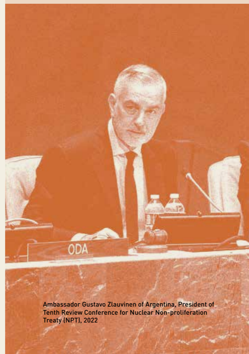
Ambassador Gustavo Zlauvinen of Argentina, President of Tenth Review Conference for Nuclear Non-proliferation Treaty (NPT), 2022

The NPT and the CTBT are closely interconnected. While the NPT focuses on preventing the spread of nuclear weapons, its preamble explicitly calls for the “discontinuance of all test explosions of nuclear weapons for all time”, highlighting the urgent need for a global ban on nuclear testing.