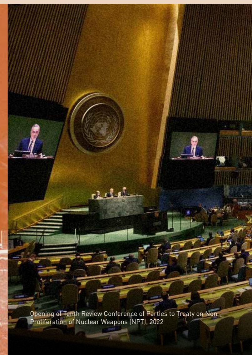
Opening of Tenth Review Conference of Parties to Treaty on Non-Proliferation of Nuclear Weapons (NPT), 2022