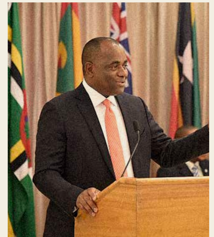
Roosevelt Skerrit, Prime Minister of Dominica (at time of CTBT ratification)

Notably, all six Annex 2 States in the LAC region - Argentina, Brazil, Chile, Colombia, Mexico, and Peru - have signed and ratified the Treaty.